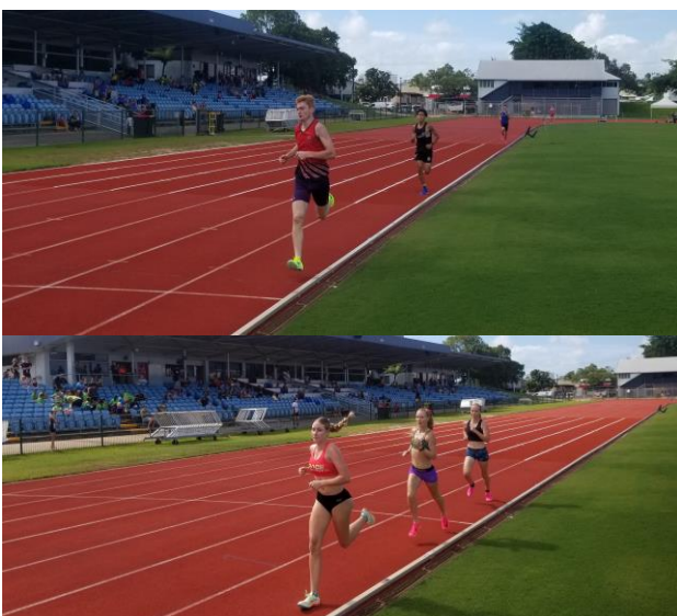
Open Men's and Women's 1500m events on the track, Barlow Park, Cairns.