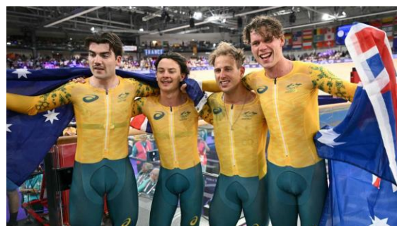
Oliver Bleddyn, Sam Welsford, Conor Leahy & Kelland O'Brien share Olympic gold.

Completing the redemption trifecta was the men's cycling pursuit squad of Sam Welsford, Kelland O'Brien, Conor Leahy, and Oliver Bleddyn. The Australians had famously crashed out of this race in Tokyo three years ago at the qualification stage, and not many gave the new-look line-up much of a chance of making the podium in Paris. Yet they walked away from the Saint-Quentin-en-Yvelines Velodrome with gold and a new world record in the event.