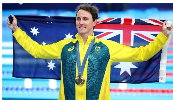
Cameron McEvoy's rise to become Olympic champion.

And then there's Cameron McEvoy. Having flunked his only individual Olympic final, the 100m freestyle in Rio eight years ago, the star sprinter was out to make amends in the 50m dash in Paris. McEvoy powered his way to gold in a stacked field, and, like Fox, erased those past demons in an instant.