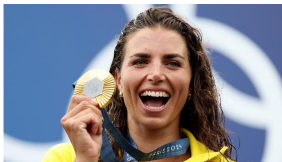
History made as Jessica Fox wins 2 Gold.

The first of which was flag bearer Jess Fox. Nobody will ever forget those heartbreaking scenes in Tokyo when she missed out on gold in the traditional K1. It was utter despair. But that would all become a distant memory, at least temporarily, after a jaw-dropping run at the Vaires-sur-Marne rapids in east Paris. Fox blitzed the field to finally grab that gold medal before backing it up in the C1 three days later.