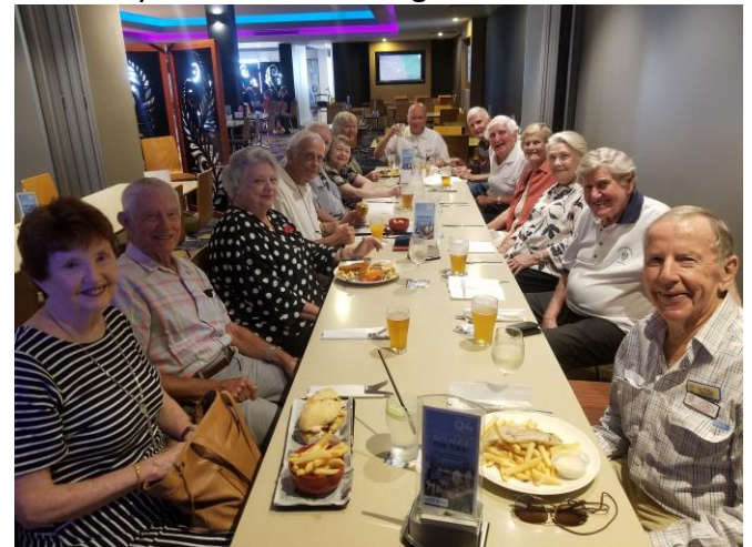
2023 AGM Luncheon.