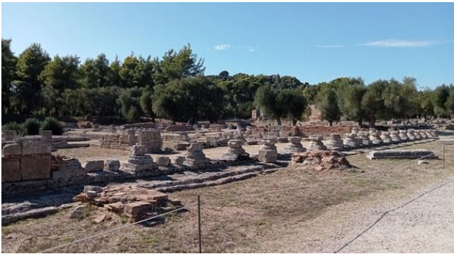
Above: The temple of Hera , an ancient Archaic Greek temple that was dedicated to Hera, queen of the Greek gods. It was the oldest temple at Olympia and one of the most venerable in all Greece. It was originally a joint temple of Hera and Zeus, chief of the gods, until a separate temple was built for Zeus. It is at the altar of this temple, which is oriented east-west, that the Olympic flame is lit and carried to all parts of the world. The torch of the Olympic flame is lit in its ruins to this day.