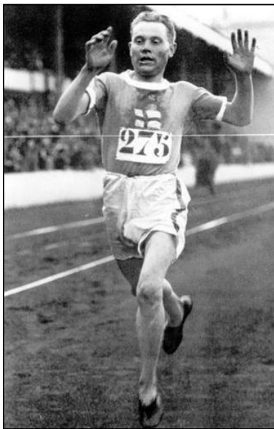
(Above, Nurmi at the 1920 Summer Olympics)

Nurmi made his international debut in August at the 1920 Summer Olympics in Antwerp, Belgium. From the races allotted to him from the Finnish organisers he finished 2 nd with Silver in the 5,000m, but went on to win Gold in the 10,000m, Cross Country & Cross