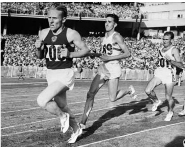
Vladimir Kuts, Gordon Pirie and Australian, Alan Lawrence.

Having lost his world record again in 1955, Kuts was still one of the favourites for the 1956 Summer Olympics in Melbourne. His chief opponent in the 5,000m was British runner Gordon Pirie, who had broken the world record earlier that year. However, Kuts had set a new 10,000 metres world record shortly before the Games. In the first track & field final, the 10,000m, Kuts, as always, led from the start, he would employ quick varying pace, sprint & slow tactic, making others follow his style from the front and finally breaking Pirie's spirit attack 4 laps from the end and winning by a wide margin. He broke away from Pirie with a final, desperate sprint, and admitted later that had Pirie stayed with him on that sprint, he might have dropped out due to fatigue. Pirie exhausted then faded badly, Jozsef Kovacs of Hungary took Silver and Australian Alan Lawrence from Punchbowl, Sydney, finished 3 rd taking Bronze.